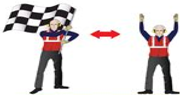
Flagman directs pilot to signalman if traffic conditions require