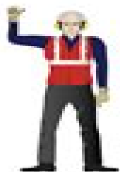
All clear (O.K.)