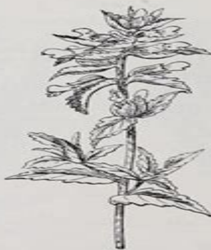
Fig. 482. RHINANTHUS CRISTA-GALLI.