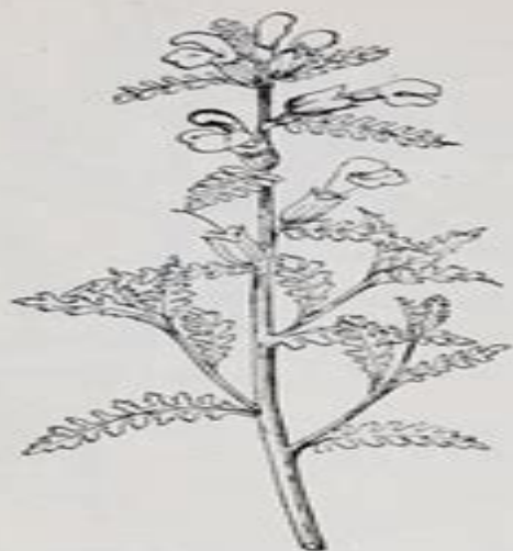
Fig. 479. PEDICULARIS PALUSTRIS.