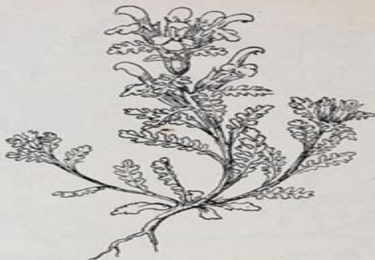
Fig. 480 PEDICULARIS SYLVATICA.