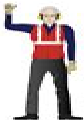
All clear (O.K.)