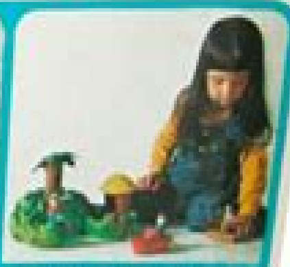
Hours of fun with Gilligan and friends.