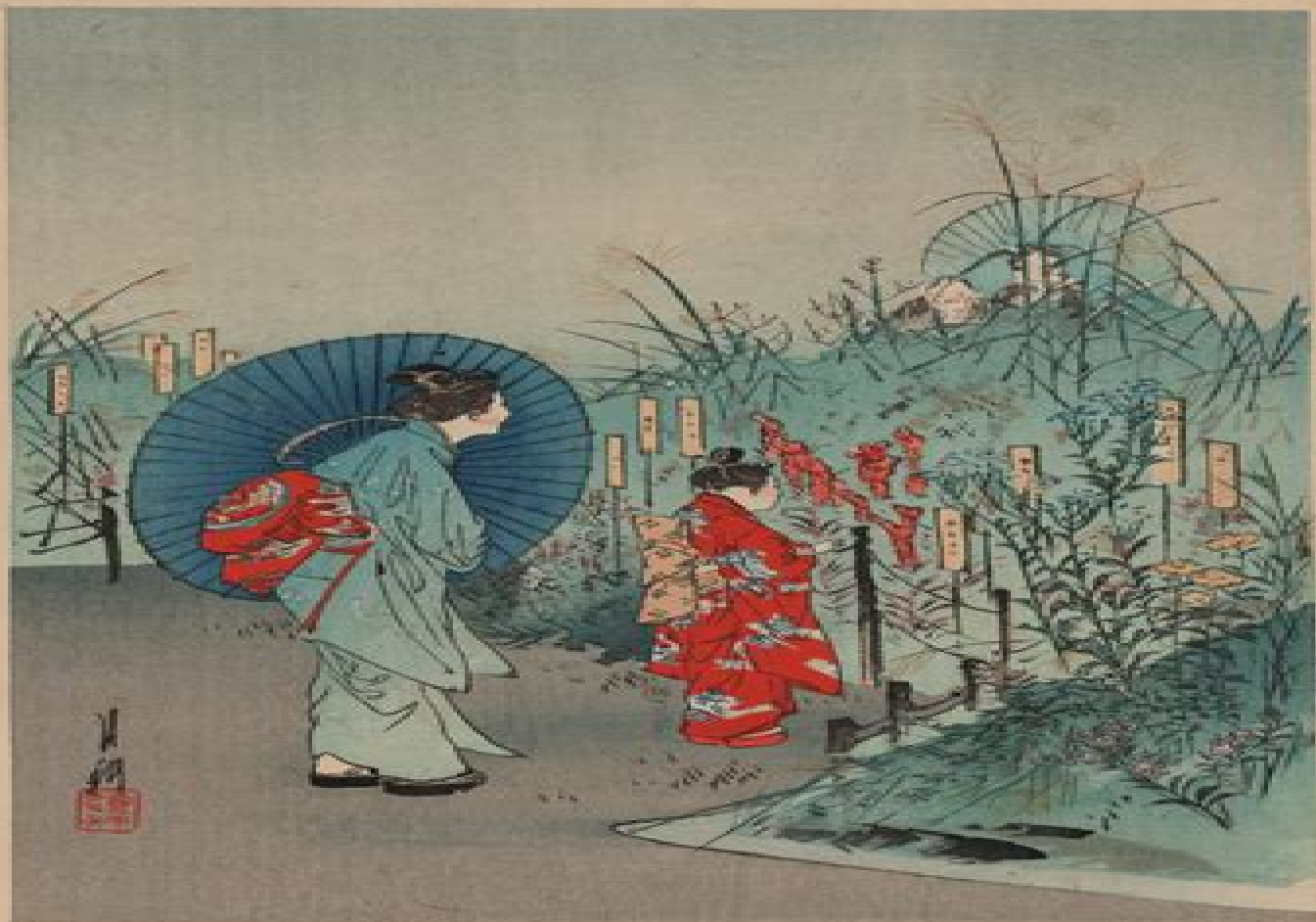
AUTUMN FLOWERS. AT THE HAKKA-YEN, MUKOJIMA.