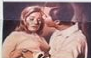
A doctor who loves is doomed to die!