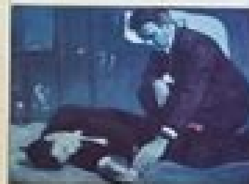
The surgical shock that leads to crime!