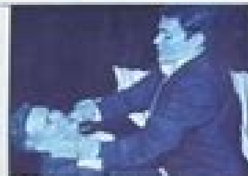
The ill-fated hands that belong to another!