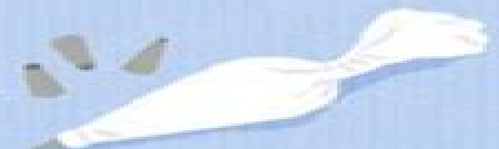
Piping Bag & Tips