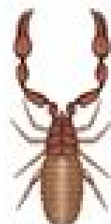
false scorpion (Pseudoscorpiones)