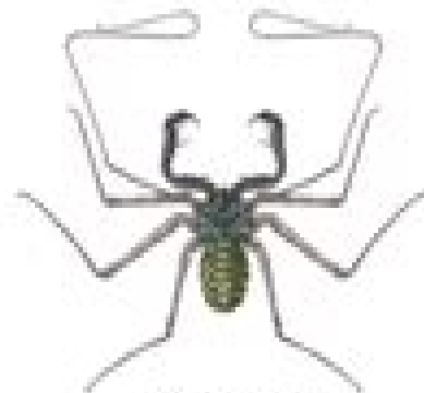
tailless whip scorpion (Amblypygi)