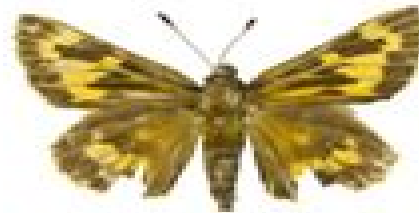
Mafa Grizzled Skipper