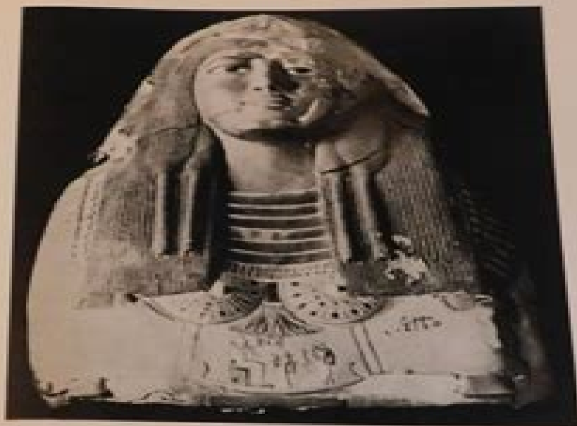
A. — Funerary mask.