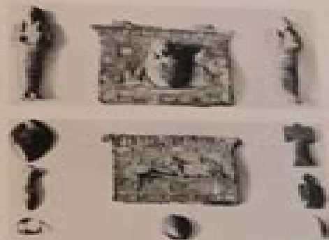
B. — Funerary objects, pectorals and amulets.