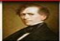
14 th FRANKLIN PIERCE (1853-1857)