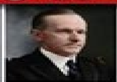
30 th CALVIN COOLIDGE (1923-1929)