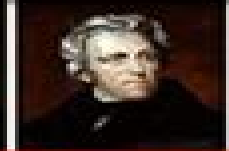
7 th ANDREW JACKSON (1829-1837)