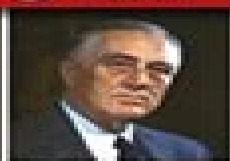
32 nd FRANKLIN D. ROOSEVELT (1933-1945)