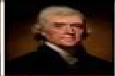
3 rd THOMAS JEFFERSON (1801-1809)