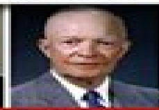
34 th DWIGHT D. EISENHOWER (1953-1961)