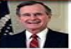
42 nd BILL CLINTON (1993-2001)