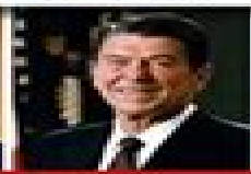
40 th RONALD REAGAN (1981-1989)