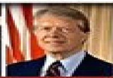
39 th JIMMY CARTER (1977-1981)