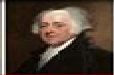
2 nd JOHN ADAMS (1797-1801)