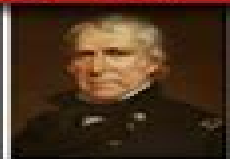
12 th ZACHARY TAYLOR (1849-1850)