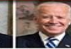
46 th JOE BIDEN (2021- )