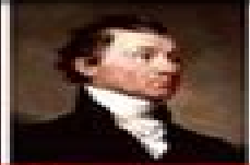
5 th JAMES MONROE (1817-1825)