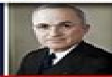
33 rd HARRY S. TRUMAN (1945-1953)