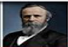
19 th RUTHERFORD B. HAYES (1877-1881)