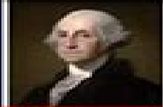
1 st GEORGE WASHINGTON (1789-1797)