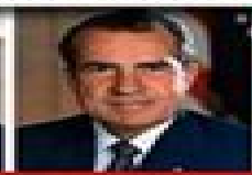
37 th RICHARD NIXON (1969-1974)