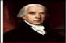
4 th JAMES MADISON (1809-1817)