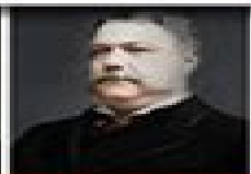
21 st CHESTER ARTHUR (1881-1885)