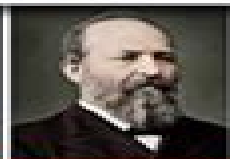
20 th JAMES A. GARFIELD (1881)