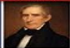
9 th WILLIAM H. HARRISON (1841)