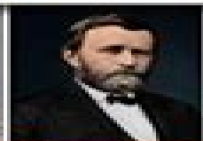
18 th ULYSSES S. GRANT (1869-1877)