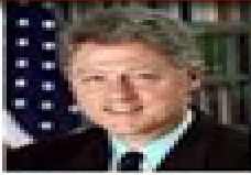
43 rd GEORGE W. BUSH (2001-2009)