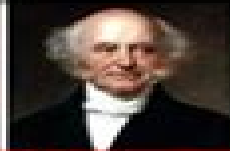
8 th MARTIN VAN BUREN (1837-1841)