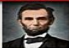
16 th ABRAHAM LINCOLN (1861-1865)