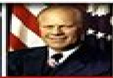
38 th GERALD R. FORD (1974-1977)