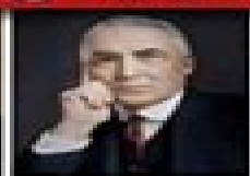
29 th WARREN G. HARDING (1921-1923)