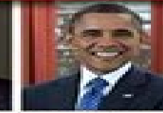
45 th DONALD TRUMP (2017-2021)