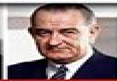
36 th LYNDON B. JOHNSON (1963-1969)