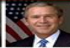
44 th BARACK OBAMA (2009-2017)