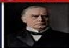
25 th WILLIAM MCKINLEY (1897-1901)