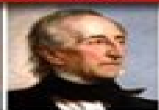
10 th JOHN TYLER (1841-1845)