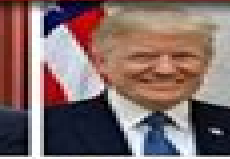
46 th JOE BIDEN (2021- )