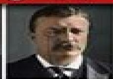
26 th THEODORE ROOSEVELT (1901-1909)