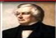
13 th MILLARD FILLMORE (1850-1853)