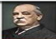
24 th GROVER CLEVELAND (1893-1897)