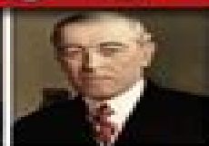
28 th WOODROW WILSON (1913-1921)