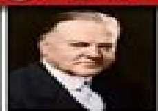
31 st HERBERT HOOVER (1929-1933)