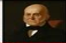
6 th JOHN QUINCY ADAMS (1825-1829)