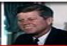
35 th JOHN F. KENNEDY (1961-1963)