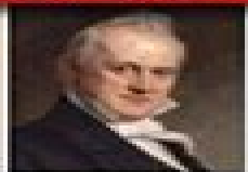
15 th JAMES BUCHANAN (1857-1861)