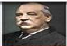
22 nd GROVER CLEVELAND (1885-1889)