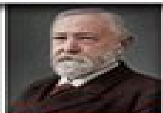
23 rd BENJAMIN HARRISON (1889-1893)