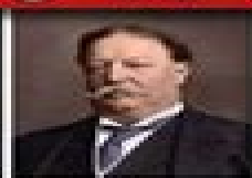
27 th WILLIAM HOWARD TAFT (1909-1913)