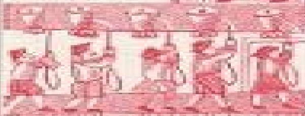
WHEELS P. 104