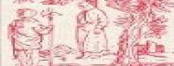
GLASS P. 107