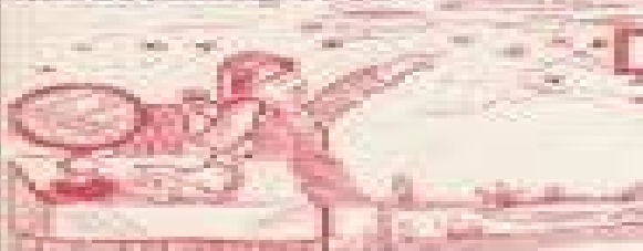
ARTHOLOGICAL P. 100