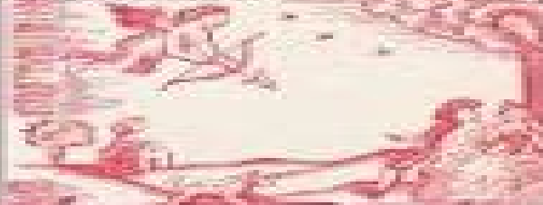
ETROLOGICAL P. 102