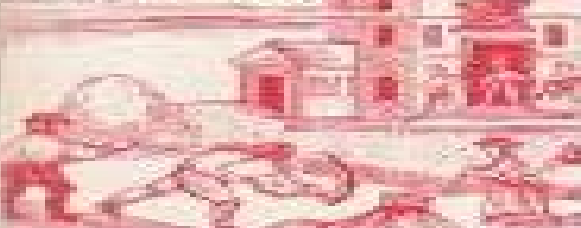
HARVEST P. 106