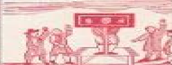
STREET P. 105