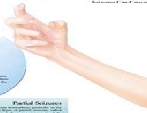
Seizures Can Cause

The brain is also split into two hemispheres. The right half controls the left side of the body, and the left half controls the right side of the body. Each hemisphere is divided into four lobes. Each lobe has its own special functions, each associated with specific activities.