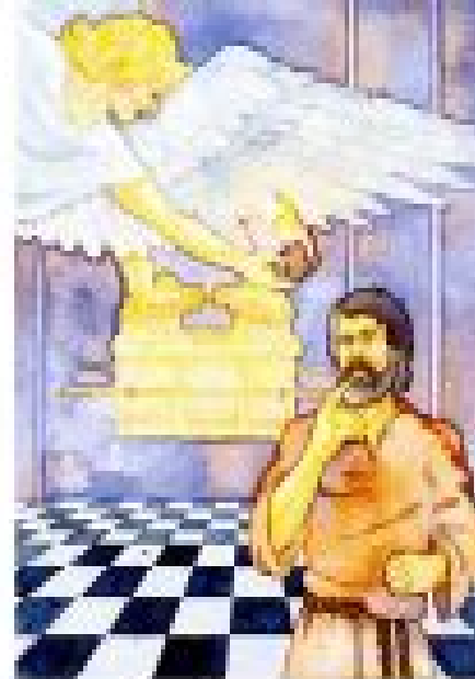
Isaiah 740-700 BCE