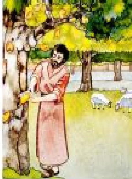
Amos 760 BCE