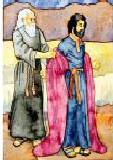
Elijah and Elisha 850 BCE