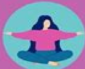
Exhibit vulnerability to build trust

Show openness to other ideas and strategies