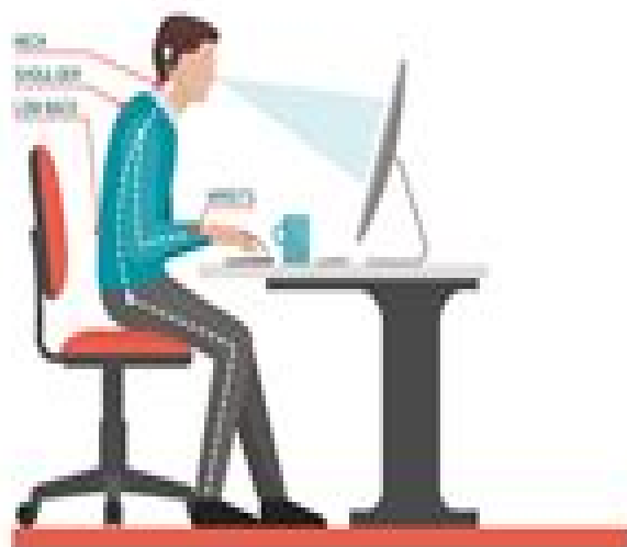
WRONG SITTING POSTURE