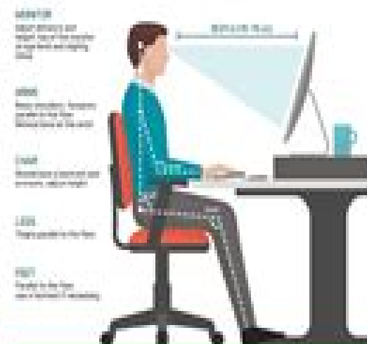
CORRECT SITTING POSITION