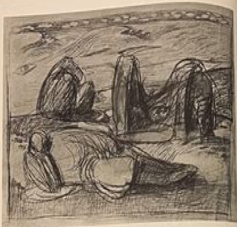
19. "The Shepherdess" (1900) Auguste Rodin (Paris, Musée Rodin)