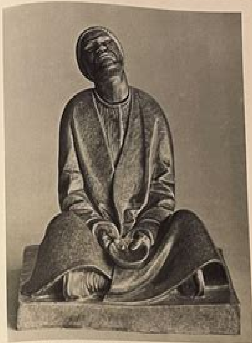
21. "The Shepherdess" (1900) Auguste Rodin (Paris, Musée Rodin)