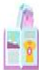
FLYERS & BROCHURES