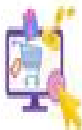
SHOPPING VIA COMPUTER