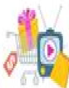
SHOPPING VIA TV