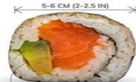
4 OR MORE FILLINGS