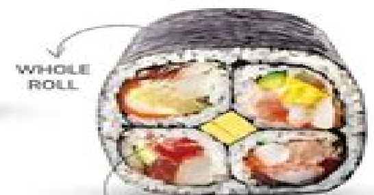
SEVEN DIFFERENT FILLINGS, EACH REPRESENTING ONE GOD OF FORTUNE