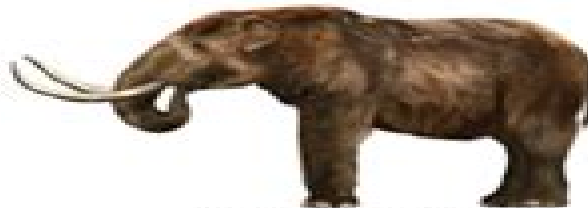
American Mastodon ( Mammut americanum )