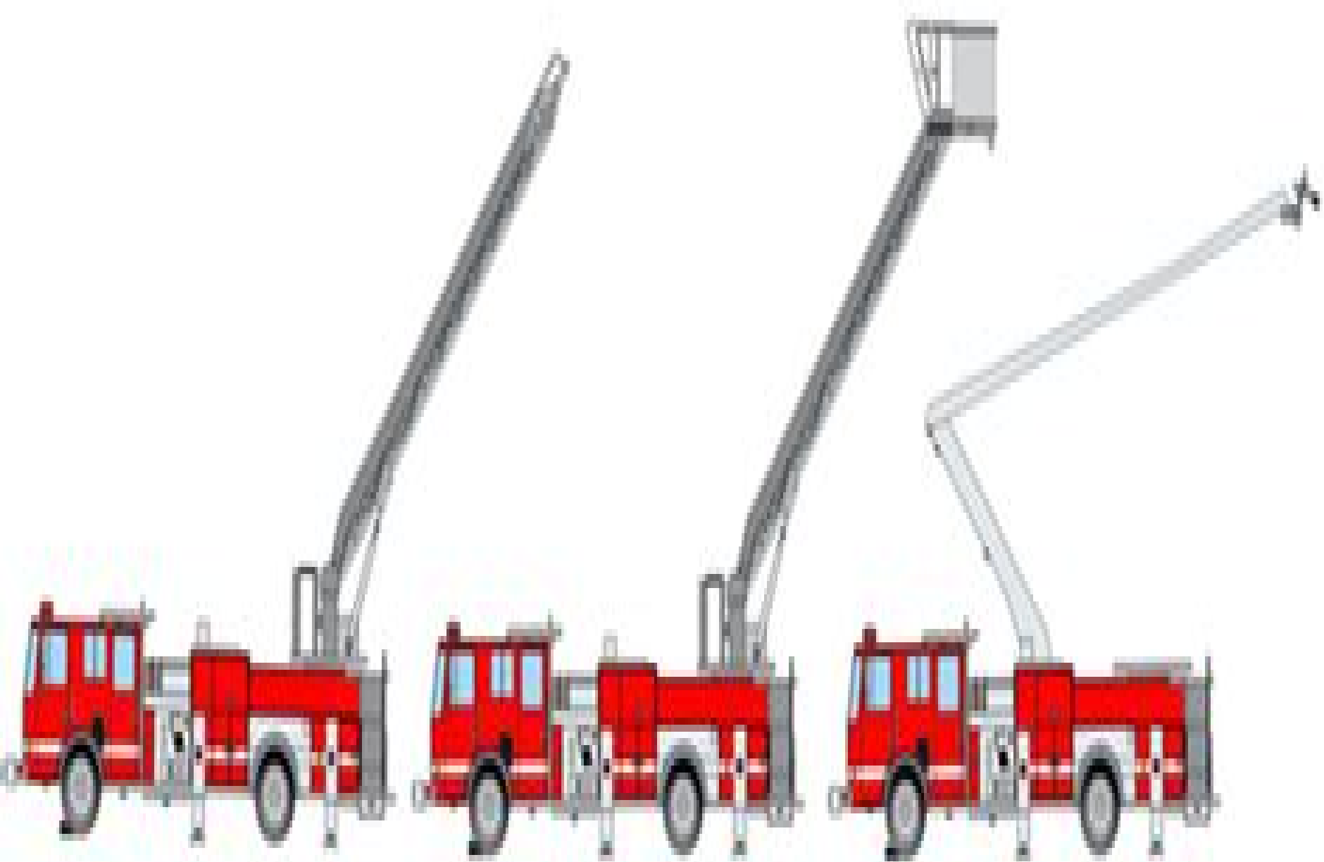
Aerial Ladder Apparatus