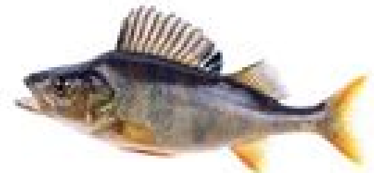
White perch ( Morone americana )