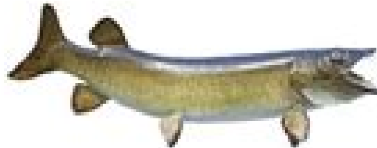
Huskellunge ( Esox masquinongy )