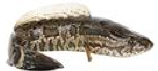
Northern snakehead ( Channa argus )