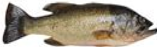
Largemouth bass ( Micropterus salmoides )