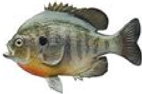
Bluegill ( Lepomis macrochirus )