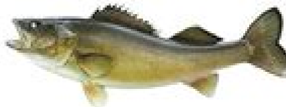
Walleye ( Sander vitreus )