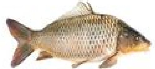
Common carp ( Cyprinus carpio )