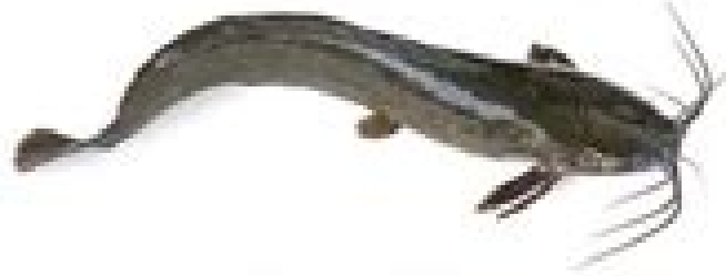
Channel catfish ( Ictalurus punctatus )