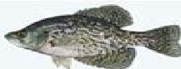
Black crappie: SR 3.83 lbs; BC 14/2.0 lbs