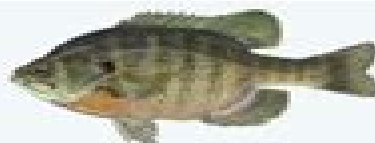
Bluegill: SR 2.95 lbs; BC 10/1.0 lb