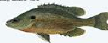
Spotted sunfish: SR 0.83 lbs; BC 7/0.5 lb