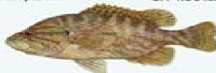
Warmouth: SR 2.44 lbs; BC 9/0.5 lb