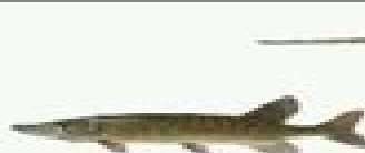
Chain pickerel: SR 6.96 lbs; BC 22/3.0 lbs