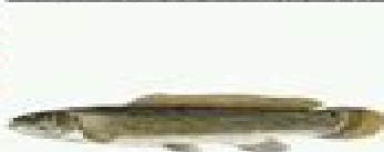
Bowfin: SR 19.00 lbs; BC 28/8.0 lbs