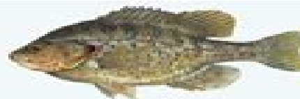
Redear sunfish: SR 4.86 lbs; BC 11/1.25 lbs