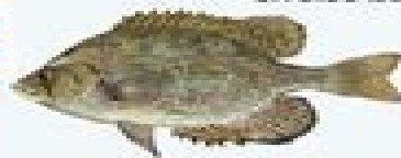
Flier: SR 1.35 lbs; BC 8/0.5 lb