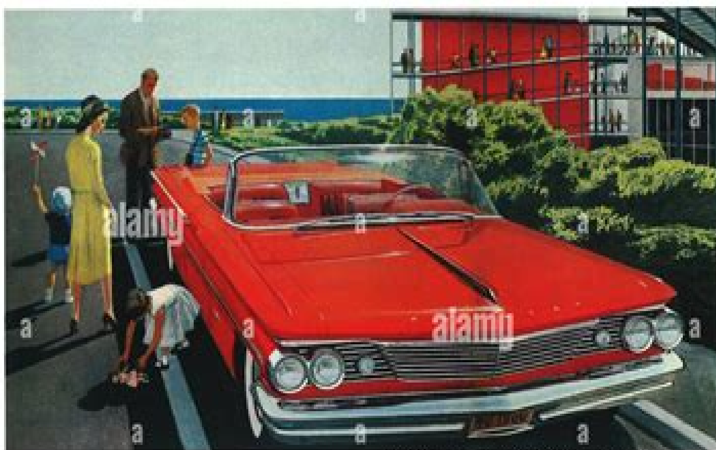
High point of the day - vintage car