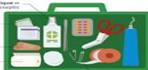
le ruban adhésif adhesive tape