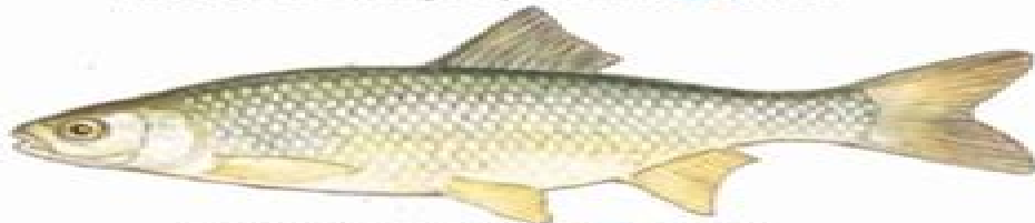
6. Dace Leuciscus leuciscus 20-30 cm