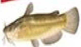
Rock Bass Ambloplites rupestris

Description: One species that lives in rocky areas. It has a large head, a prominent snout, and a large mouth. It is a common species in many freshwater bodies of water.