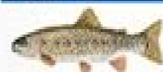
Rock Bass Ambloplites rupestris

Description: One species that lives in rocky areas. It has a large head, a prominent snout, and a large mouth. It is a common species in many freshwater bodies of water.