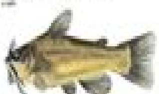
Rock Bass Ambloplites rupestris

Description: One species that lives in rocky areas. It has a large head, a prominent snout, and a large mouth. It is a common species in many freshwater bodies of water.