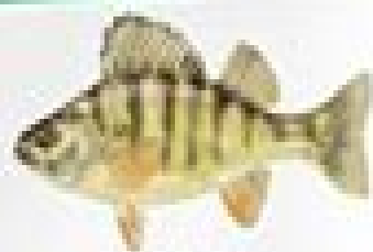
Yellow Perch Perca flavescens

Description: Long-bodied, yellow to golden-brown fish with vertical stripes. It has a large head, a prominent snout, and a large mouth. It is a common species in many freshwater bodies of water.