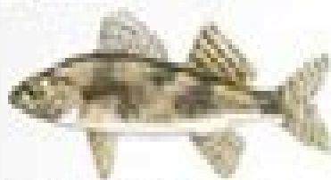
Striped Bass Morone saxatilis

Description: One species that lives in rocky areas. It has a large head, a prominent snout, and a large mouth. It is a common species in many freshwater bodies of water.