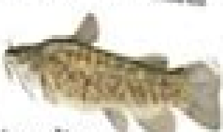
Rock Bass Ambloplites rupestris

Description: One species that lives in rocky areas. It has a large head, a prominent snout, and a large mouth. It is a common species in many freshwater bodies of water.