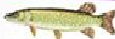
Northern Pike Esox lucius

Description: One of the largest and most common species of fish. It has a large head, a prominent snout, and a large mouth. It is a common species in many freshwater bodies of water.