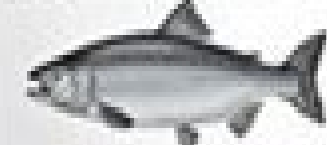
Rock Bass Ambloplites rupestris

Description: One species that lives in rocky areas. It has a large head, a prominent snout, and a large mouth. It is a common species in many freshwater bodies of water.