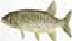
Rock Bass Ambloplites rupestris

Description: One species that lives in rocky areas. It has a large head, a prominent snout, and a large mouth. It is a common species in many freshwater bodies of water.