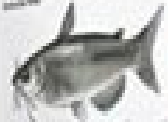
Rock Bass Ambloplites rupestris

Description: One species that lives in rocky areas. It has a large head, a prominent snout, and a large mouth. It is a common species in many freshwater bodies of water.