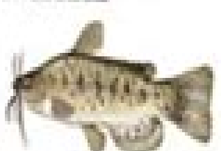
Rock Bass Ambloplites rupestris

Description: One species that lives in rocky areas. It has a large head, a prominent snout, and a large mouth. It is a common species in many freshwater bodies of water.