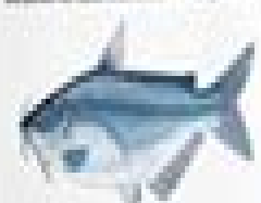
Rock Bass Ambloplites rupestris

Description: One species that lives in rocky areas. It has a large head, a prominent snout, and a large mouth. It is a common species in many freshwater bodies of water.