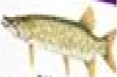
Rock Bass Ambloplites rupestris

Description: One species that lives in rocky areas. It has a large head, a prominent snout, and a large mouth. It is a common species in many freshwater bodies of water.