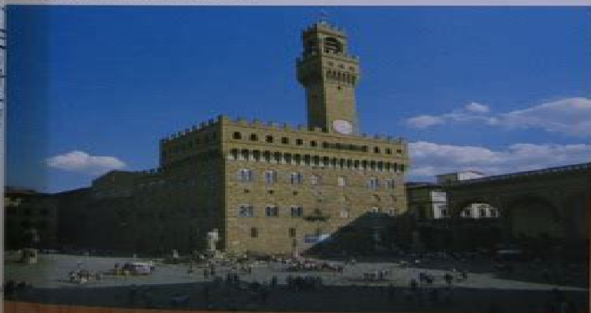
A view of Piazza della Signoria.

P iazza della Signoria is the centre of Florentine civic life. It was created in the area occupied in the 13th century by the houses of some powerful Ghibelline families, including the Liberti and the Foraboschi , which were razed to the ground by the Guelph faction after the battle of Benevento. Part of the area around a surviving tower belonging to the Foraboschi family was occupied by Palazzo Vecchio , which was built with an asymmetrical ground-plan due to the nearby presence of the old church of San Piero Scheraggio. The church was later demolished to make space for the Uffizi. The appearance of the square, which was originally called the Piazza dei Priori, changed various times during the course of the centuries. In the middle of the 14th century the Tettoia dei Pisani was built along the west side, only to be demolished in 1870. At the end of the 15th century the Loggia dei Lanzi was built on the south side, and was enriched with precious sculptures during the 16th century. Other sculptures decorated the square in the same years. The steps in front of Palazzo Vecchio were used to accommodate Hercules and Cacus by Baccio Bandinelli and the David by Michelangelo , the latter being replaced by a copy in 1873 when the original was taken to the Accademia. On the far left of the steps Ammannati erected the Fountain of Neptune , and the part of the square nearest the Tribunale della Mercanzia became the site for the Equestrian Monument to Cosimo I by Giambologna .