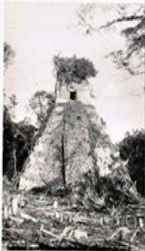
Templo - Templo de San Juan, Yucatan, Mexico

With 100 Plates, an Introduction and a Map