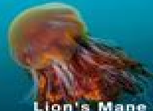
Lion's Mane Jellyfish