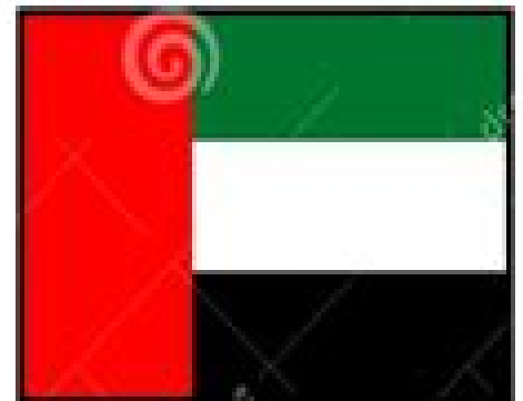
United Arab Emirates