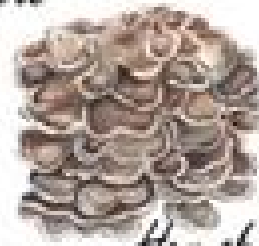
Hen of the Woods