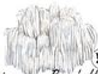
Bear's Head Tooth