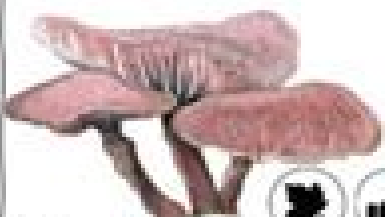
The Omnipresent Laccaria