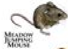
MEADOW JUMPING MOUSE