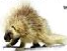
NORTH AMERICAN PORCUPINE