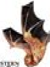
EASTERN RED BAT