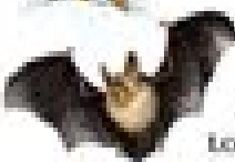
NORTHERN LONG-EARED BAT