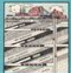
DRILLING FOR COAL