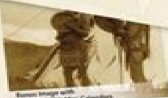
Woman in Dress with Serpent, 1904 Miss Galt's Spring, South of Lake Umbagog, c. 1908