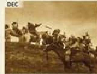
Planning a Hunt, c. 1907