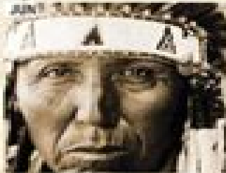
Red Wolf, Chapman, c. 1917