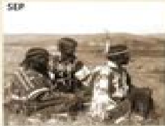
Overlooking the Canyon, 1904, c. 1910