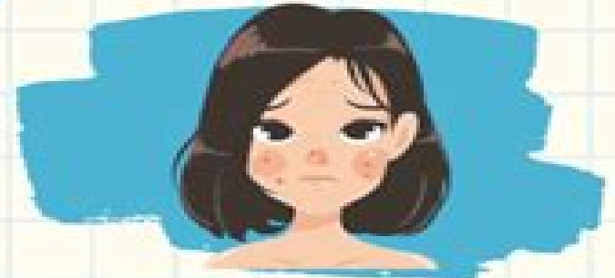
PROBLEMAS DE PIEL