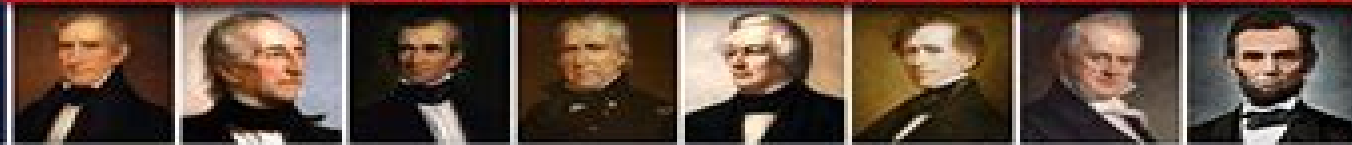
9 th WILLIAM H. HARRISON (1841) 10 th JOHN TYLER (1841-1845) 11 th JAMES K. POLK (1845-1849) 12 th ZACHARY TAYLOR (1849-1850) 13 th MILLARD FILLMORE (1850-1853) 14 th FRANKLIN PIERCE (1853-1857) 15 th JAMES BUCHANAN (1857-1861) 16 th ABRAHAM LINCOLN (1861-1865)