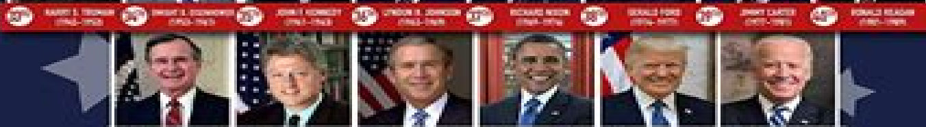
41 st GEORGE H.W. BUSH (1989-1993) 42 nd BILL CLINTON (1993-2001) 43 rd GEORGE W. BUSH (2001-2009) 44 th BARACK OBAMA (2009-2017) 45 th DONALD TRUMP (2017-2021) 46 th JOE BIDEN (2021-)