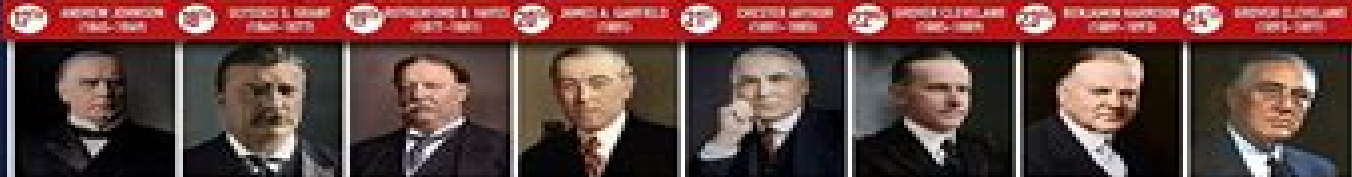
25 th WILLIAM MCKINLEY (1897-1901) 26 th THEODORE ROOSEVELT (1901-1909) 27 th WILLIAM HOWARD TAFT (1909-1913) 28 th WOODROW WILSON (1913-1921) 29 th WARREN G. HARDING (1921-1923) 30 th CALVIN COOLIDGE (1923-1929) 31 st HERBERT HOOVER (1929-1933) 32 nd FRANKLIN D. ROOSEVELT (1933-1945)