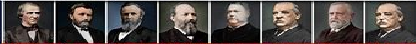
17 th ANDREW JOHNSON (1865-1869) 18 th ULYSSES S. GRANT (1869-1877) 19 th RUTHERFORD B. HAYES (1877-1881) 20 th JAMES A. GARFIELD (1881) 21 th CHESTER ARTHUR (1881-1885) 22 th GROVER CLEVELAND (1885-1895) 23 th BENJAMIN HARRISON (1889-1893) 24 th WILLIAM MCKINLEY (1897-1901)