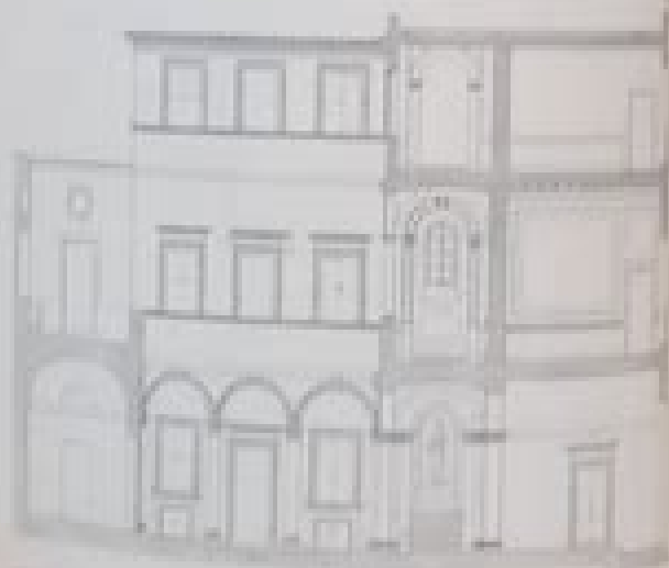
Fig. 2. Building facade.