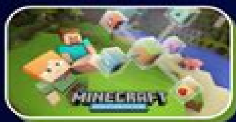
MINECRAFT - EDUCATION EDITION