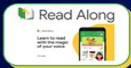
GOOGLE READ ALONG