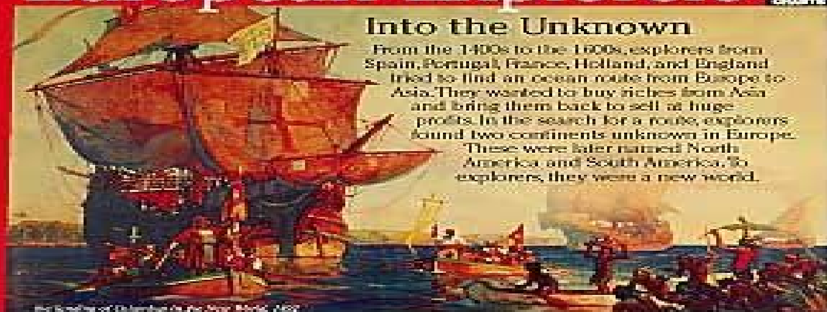
Reproduction of Columbus's ship, Santa Maria, 1492