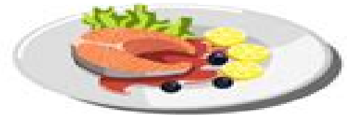
SALMON WITH LEMON