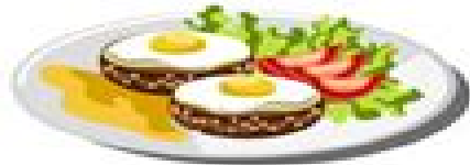
BEEFSTEAK WITH EGG