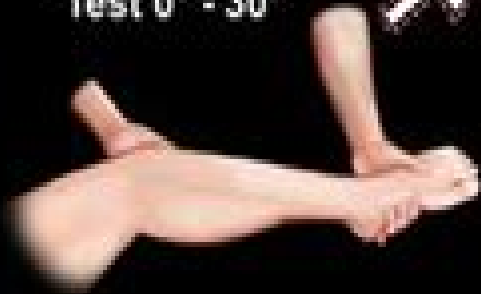
Valgus Stress Test 0° - 30°