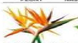
BIRD OF PARADISE