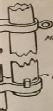
Main Mast Head