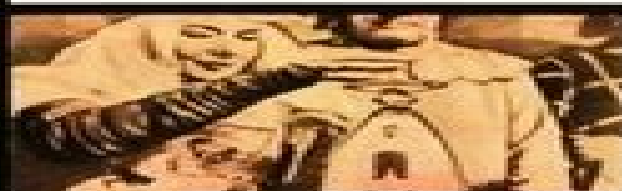
Gulliver kept under glass—a royal plaything!