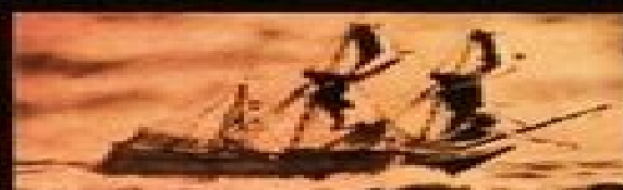
The raging storm tosses Gulliver overboard!