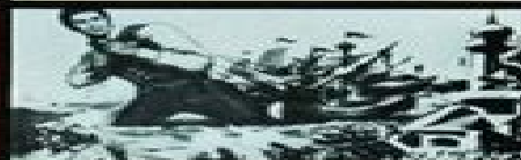
Gulliver destroys the enemies of Lilliput!