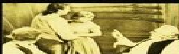
She is discovered aboard ship—a stowaway!