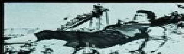
Washed ashore—captured by the Lilliputians!