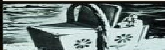
Escape when! More great adventures to come!