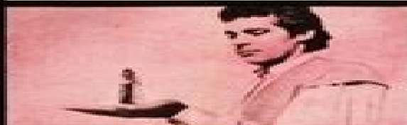
Gulliver helps two tiny lovers find happiness!