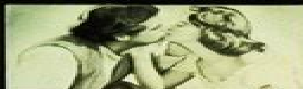
Gulliver bids farewell to his love, Elizabeth!

NOTHING LESS THAN A MIRACLE IN MOTION PICTURES!