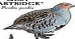
GREY PARTRIDGE* Perdix perdix