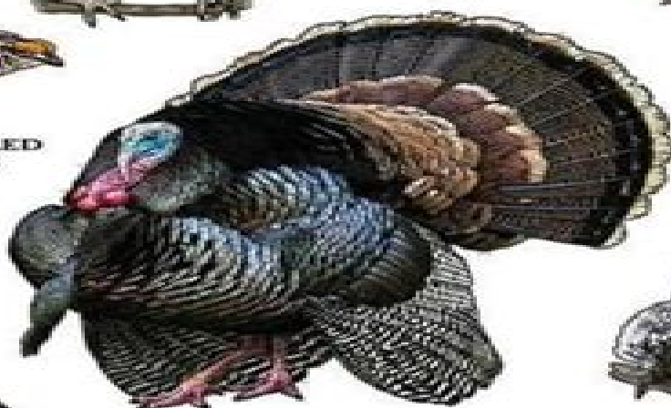
WILD TURKEY Meleagris gallopavo