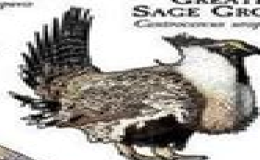
GREATER SAGE GROUSE Centrocercus urophasianus