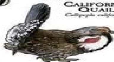
CALIFORNIA QUAIL Callipepla californica