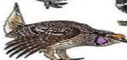
SHARP-TAILED GROUSE Tympanuchus phasianellus