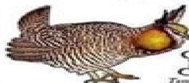
GREATER PRAIRIE CHICKEN Tympanuchus cupido