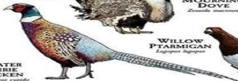
WILLOW PTARMIGAN Lagopus lagopus