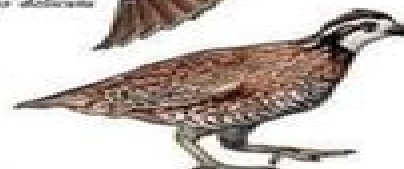
NORTHERN BOBWHITE Colinus virginianus