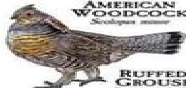
RUFFED GROUSE Bonasa umbellus