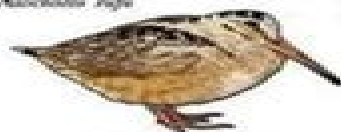
AMERICAN WOODCOCK Scolopax minor