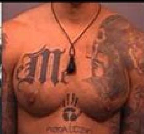
("Mexican mafia ("la," )