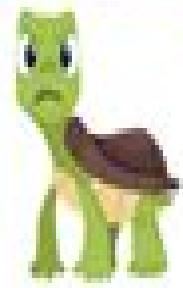
Step 1: Recognize your feelings

Tucker the Turtle was feeling angry, Tucker the Turtle was feeling angry, Tucker the Turtle was feeling angry, Tucker the Turtle was feeling angry, Tucker the Turtle was feeling angry.