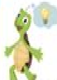
Step 4: Come out when you feel calm and free of a bad day

For more information, please visit www.nami.org or call 1-800-950-NAMI.