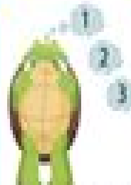
Step 3: Tuck from your chest and take three deep breaths