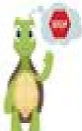
Step 2: Stop your body