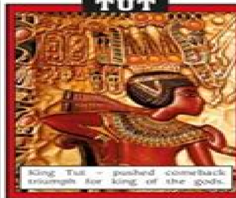
King Tut - pushed comeback triumph for king of the gods.

Tut Tut, 9, announced the togethery turn-around after high-level discussions with palace advisors. "Amun is now top god again, and his shrines and statues will be making a