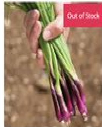
DEEP PURPLE SCALLION